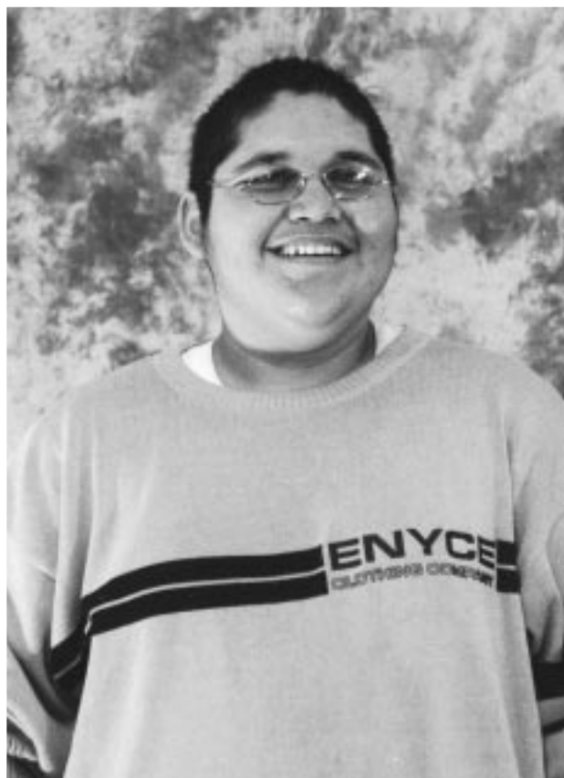
Santos, 16 "Choose your path carefully. Be safe."